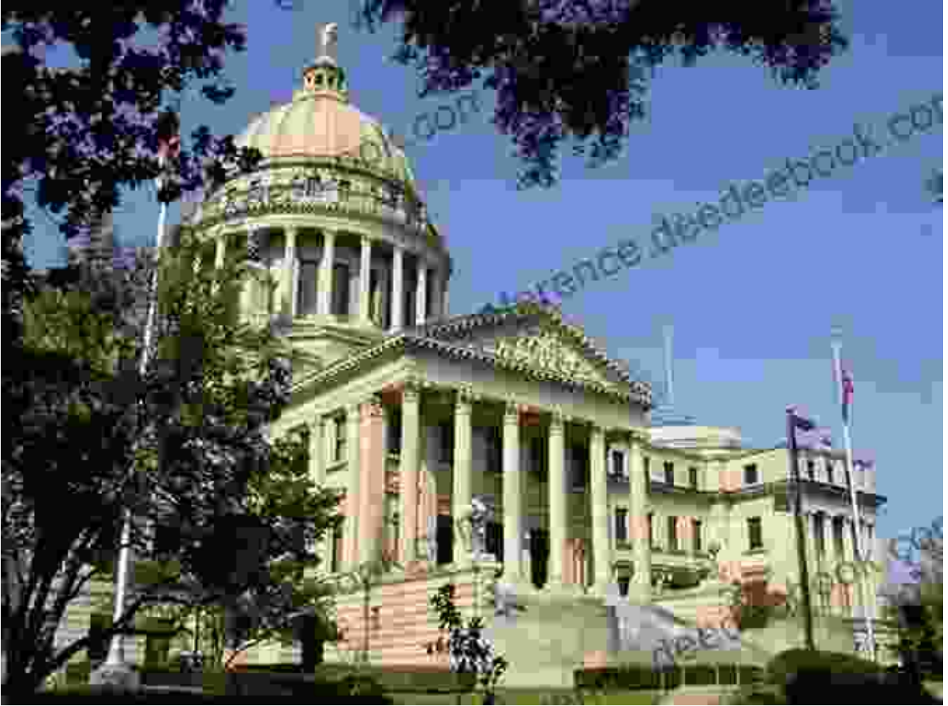
Mississippi State Capitol, Jackson, Mississippi