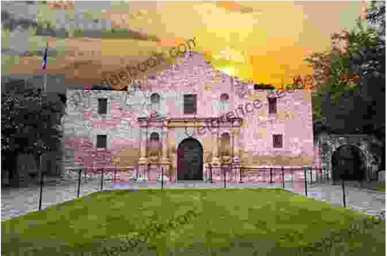
Alamo, San Antonio, Texas