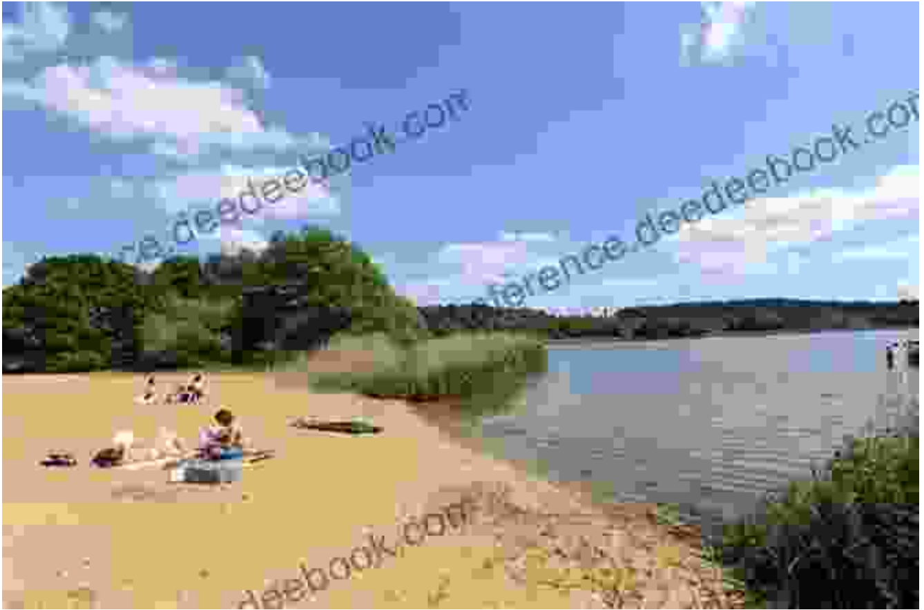
The Hermitage, Frensham Great Pond