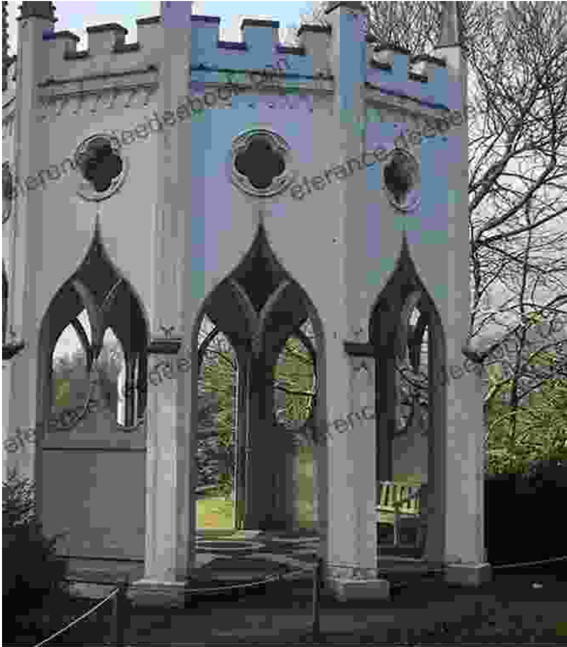
Chobham Tower, Chobham