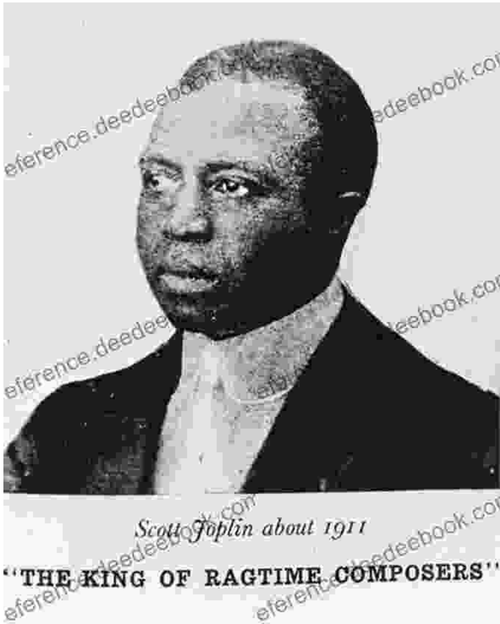
Scott Joplin about 1911