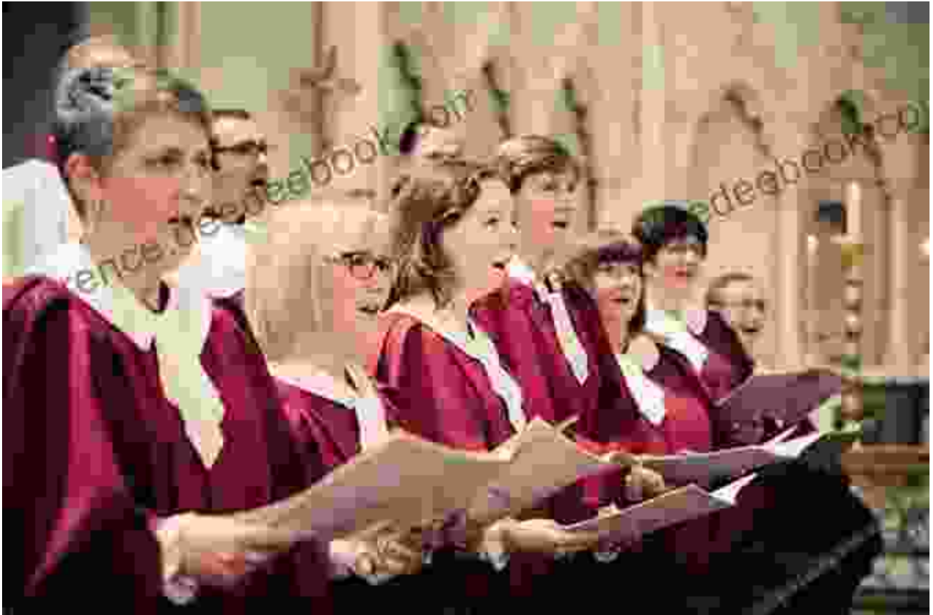
Eastern European Church Choir